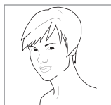
also available in adult version